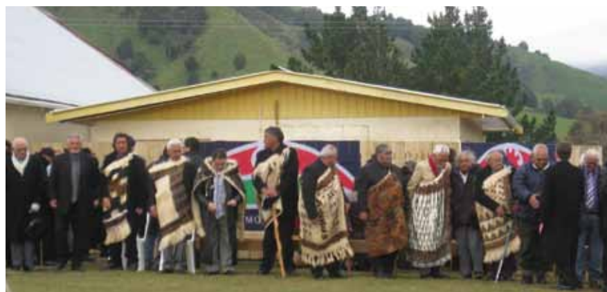
Tūhoe Rangatira greeting manuhiri – Tūhoe/Crown Political Compact Signing in Ruatāhuna

Please contact the Māori Policy Unit for further information or support.