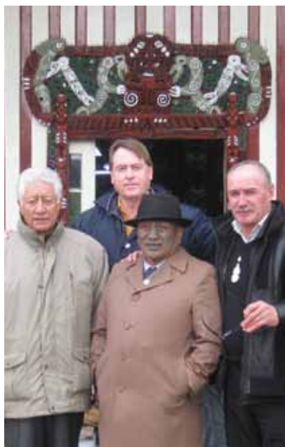
Councillors and Tame Iti, Tūhoe/Crown Political Compact signing in Ruatāhuna.