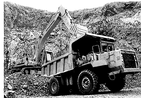
ABOVE: A Perry Group operation in the North Island.

Perry Group is one of the largest privately-owned enterprises in the Waikato, with interests in sand mining, quarrying, waste solutions and remediation, compost and fertilisers, metal protection, lime resource and property development. CS-VUE is already benefiting the company in a variety of ways, including more streamlined administration, more efficient