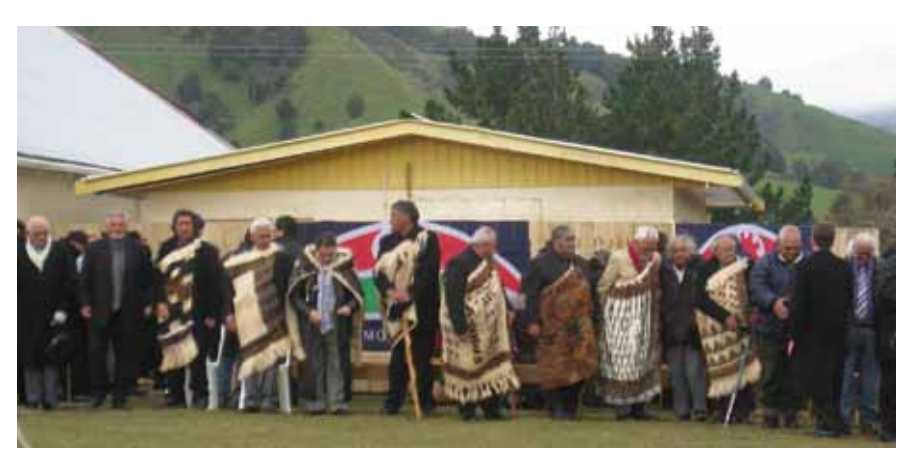
Tūhoe Rangatira greeting manuhiri – Tūhoe/Crown Political Compact Signing in Ruatāhuna

Please contact the Māori Policy Unit for further information or support.