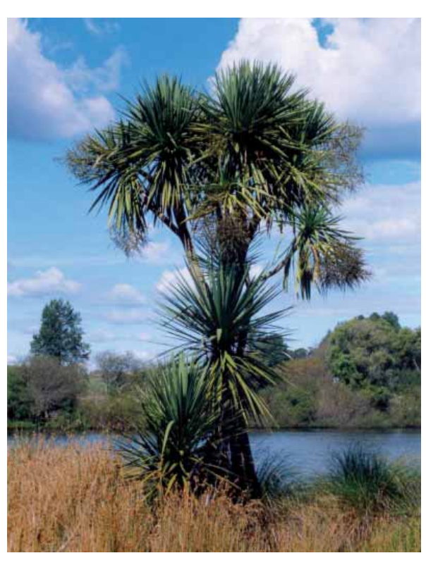
Native cabbage tree.