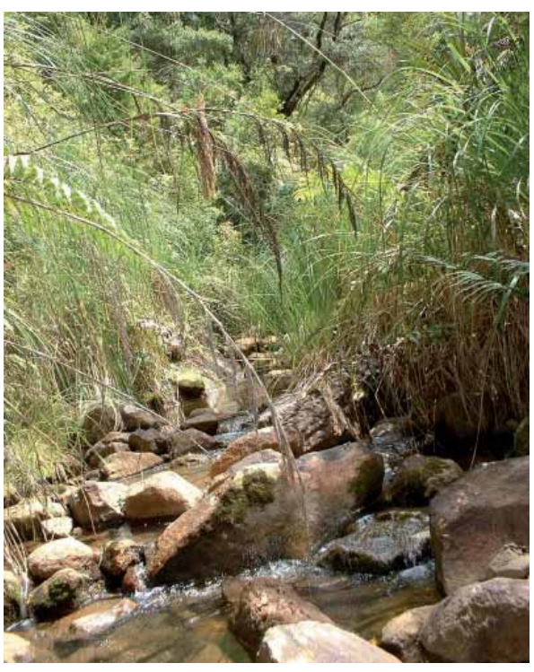
Kirikiri Stream, Coromandel.

There should be consideration of stronger protections in the Regional Policy Statement and regional plans for indigenous terrestrial biodiversity.