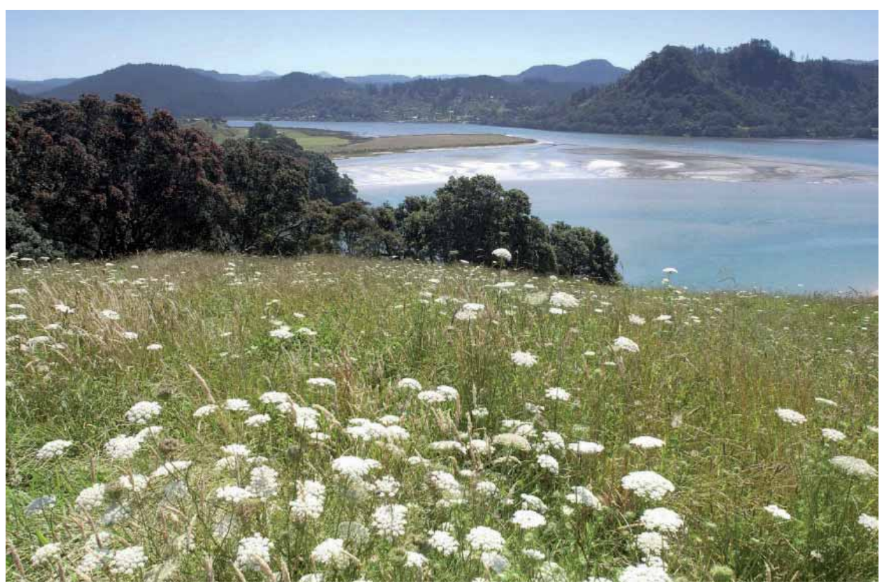
Opoutere Harbour, Coromandel.

It should be noted that the policies and methods for the objective do not envisage regionally significant heritage resources being inventoried. Instead, the significance of particular heritage resources is to be assessed on a case by case basis through district plan development processes and through resource consent processes. The objective is to be achieved by providing adequate protections to heritage resources through these processes, as well as through education and general advocacy.