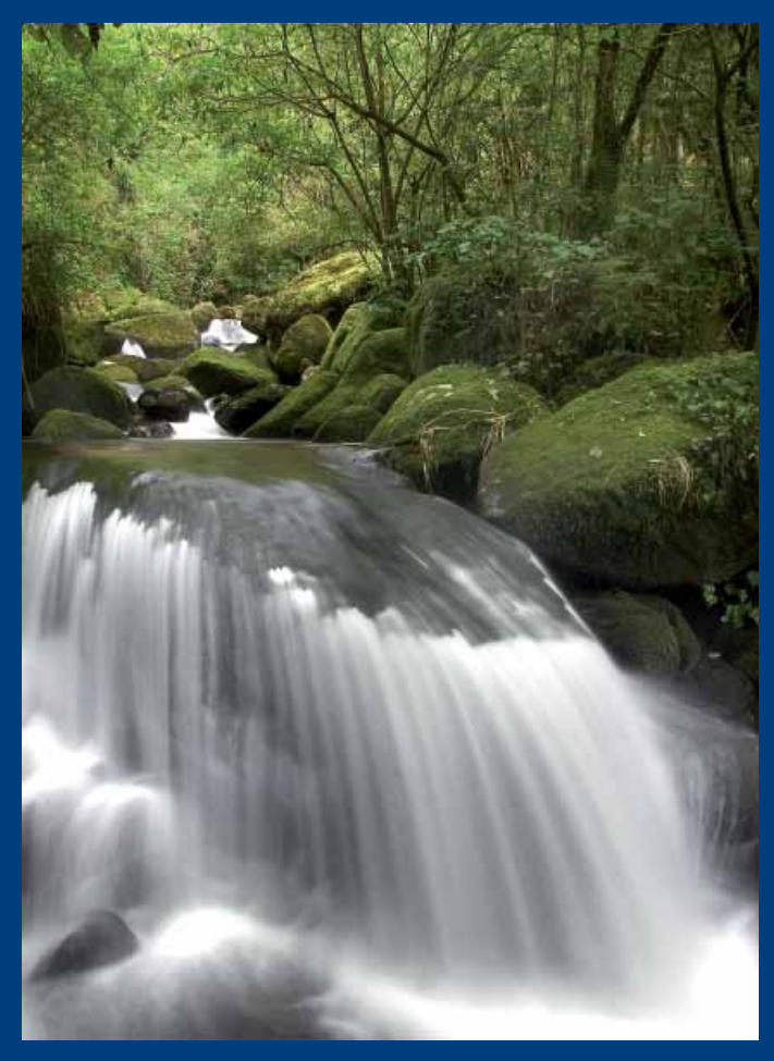
Wairere Falls, Coromandel Ranges.

HAMILTON 401 Grey Street PO Box 4010 Hamilton East Hamilton 3247 Telephone 07 859 0999 Facsimile 07 859 0998