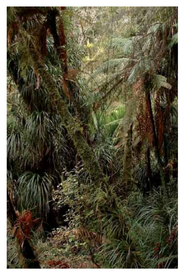
Native Bush, Te Kauri.

Section 3.15 of the RPS describes issues, objectives, policies and implementation methods for heritage. Natural heritage is dealt with in this report, while cultural heritage matters will be the subject of a future report.