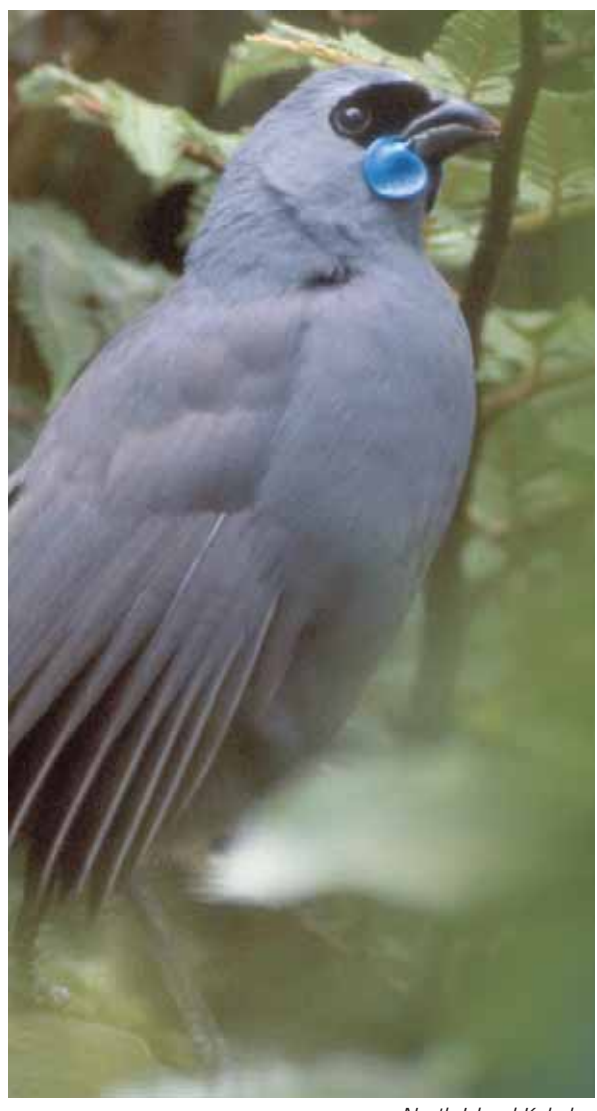
North Island Kokako.

There are a number of rules in the Regional Plan and Regional Coastal Plan which have conditions or standards which may help to avoid, remedy or mitigate adverse effects on indigenous biodiversity. This is particularly so for rules related to wetland drainage, vegetation clearance, works in the Coastal Marine Area and takes, discharges or works in water bodies. Environment Waikato staff undertake a range of regulatory responses where such rules are not complied with. Table 1 shows the number of enforcement activities which were undertaken from March 2005 to March 2006.