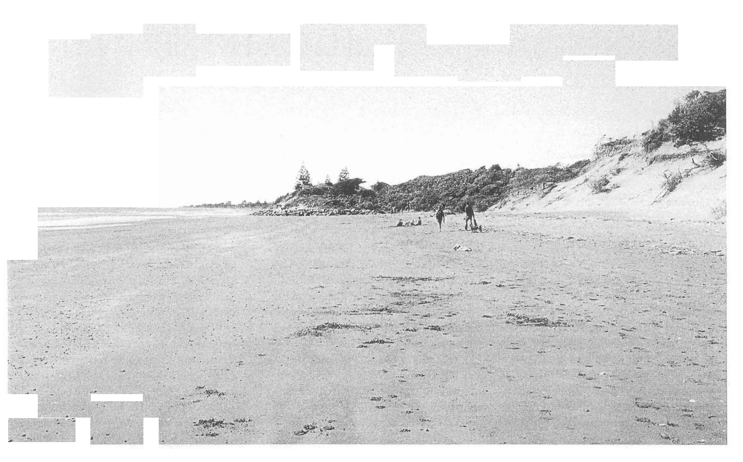
Dunes and dry beach in QE Park immediately south of the Raumati South seawall.