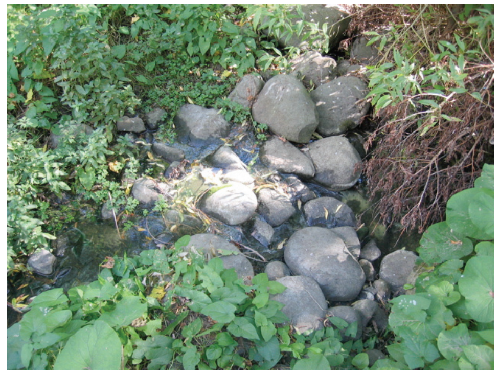
Photo 4: Blue and white algae seen by runanga representatives during a site visit to the Starborough creek. The alga was present in running water directly below the outfall.

It is noted that the poor condition of the Starborough Creek is also attributed to upper catchment activities. However, tangata whenua conclusions relating to the impacts of the sewage effluent discharge are supported by Cawthron monitoring report (2000), which concludes that "the discharge does cause some degradation of water quality in the Starborough Creek".<sup>11</sup>