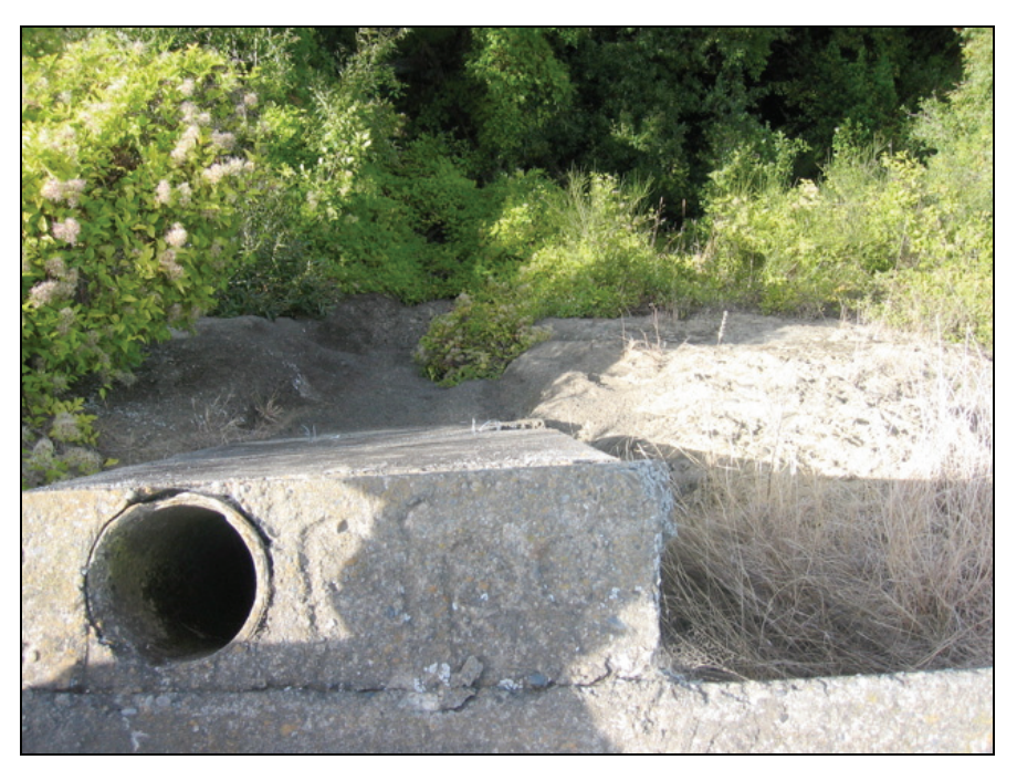
Photo 3: Discharge outfall, on the true left bank of the Starborough Creek