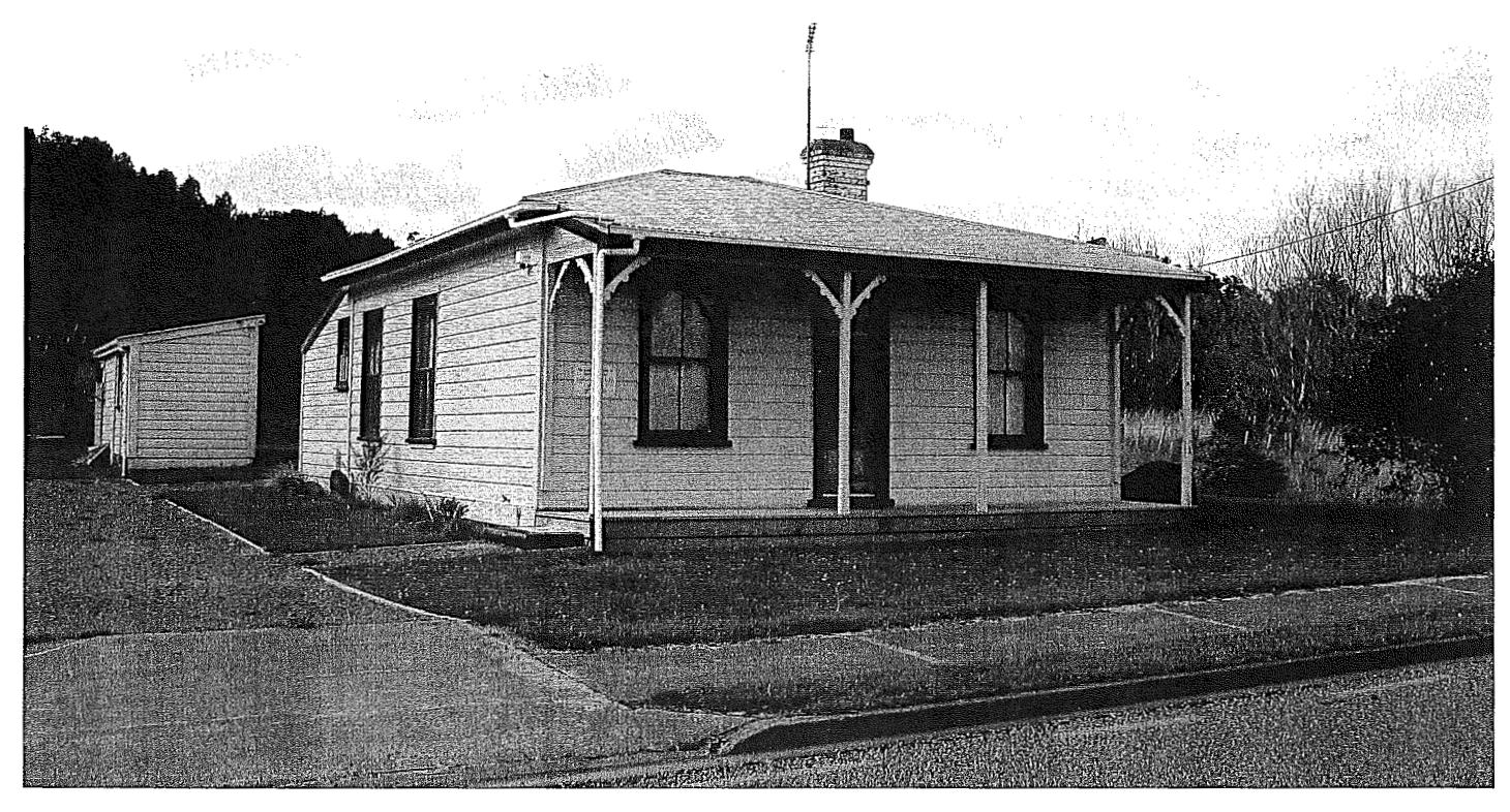
ABOVE:: Ohakune was an important station on the North Island main trunk railway line, despite its isolation. Railways provided houses here from 1908, shortly after the main trunk line was connected. Examples such as this on Railway Row were built by private contractors to a range of Public Works Department designs and predate the Frankton prefabricated house era.