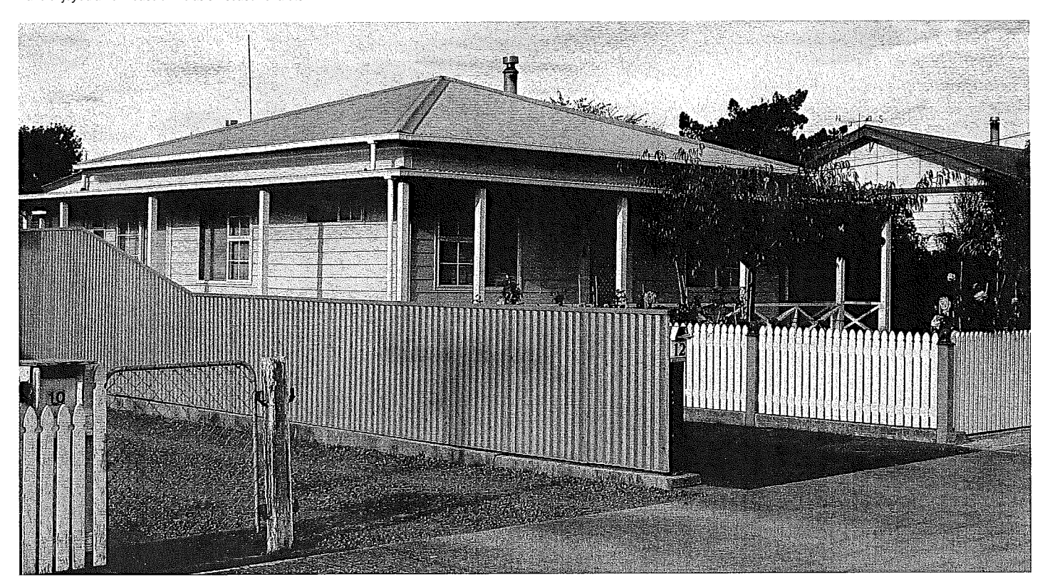
ABOVE:: An uch modified AB 296 Roof C Porch C Frankton railway house. This example has had the original porch replaced by a wraparound veranda and new window frames.