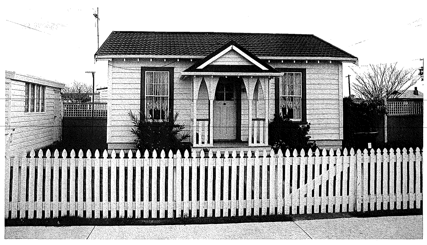
ABOVE:: Arestored AB 296 Roof A porch A cottage from Milson. A tile roof has replaced the original iron and the chimney has gone but original windows and doors remain. Of the four basic AB 296 designs this particularstyle seems to hoidparticular appear to home restorers perhaps because of its 'cottage like'look. The paling fence in front of this property was another distinctive feature of the Milson sections.

have been relocated. TheOhakune houses largely remain because of their proximity to ski slopes, having been acquired for use as ski lodges during the winter season. The Milson settlement in Palmerston North is now a mix of owner-occupied freeholded houses, with some Housing New Zealand Corporation properties, as well as some infill townhouses having been erected on the fronts of some sites. A number of the rental properties have been relocated onto smaller sites. By 2006 real estate agents were even describing for sale properties as "character houses" a term usually reserved for 1920s bungalows.