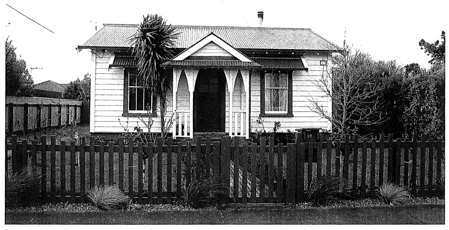
ABOVE:: Renovated AB 296 Roof A Porch A cottage at Milson in Palmerston North. Small rectangular plaque on the tap right hand side under the eavesdisplays thefactorynumber. Only two of the Milson housesappear to retain these numbers which provide another means of dating the house. Originally Milson railways staffhad mail delivered on the basis of house numbers, but because sequentially numbered houses were notside by side this caused difficulties untilresidentspetitioned Railways to be allowed to display more conventional street numbers, which was granted as long as they were only on the gates and not the houses.